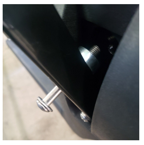
Cricket RX-5 Resort Top Instructions Rev 1.0

2. Do the same with the top hole. Leaning back rail may make it easier to install spacer. Repeat step 1. & 2. to the other side.